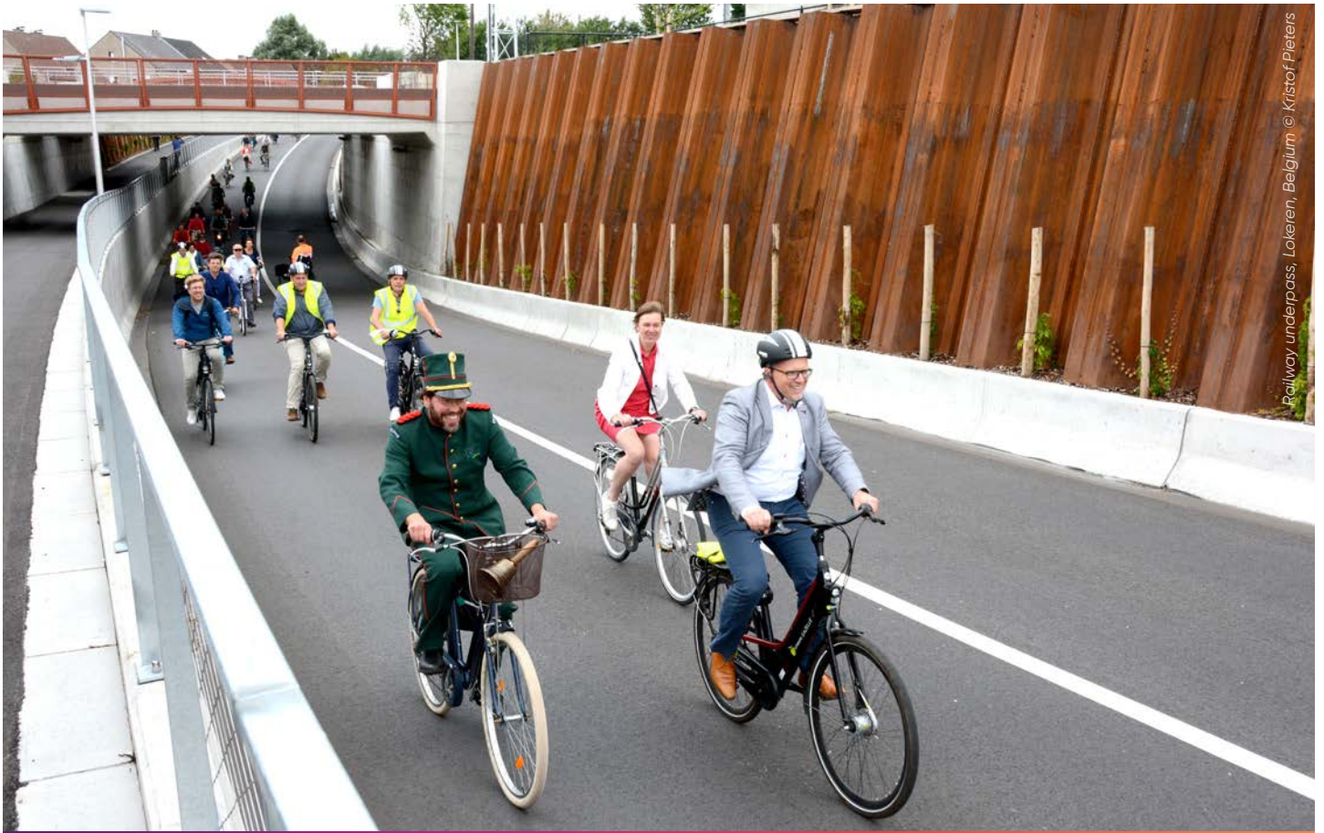
Railway underpass, Lokeren, Belgium